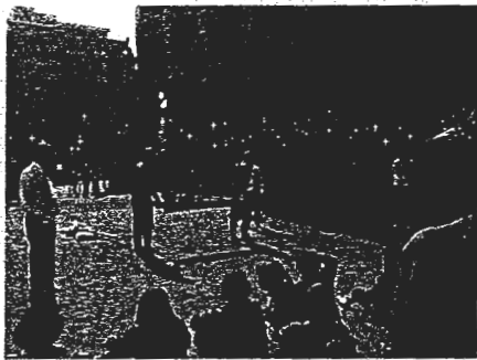
Staff of Fire Bureau conducting emergency training to school children