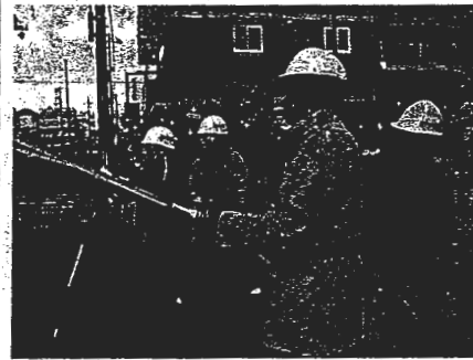
Community organization implementing a fire extinguish drill